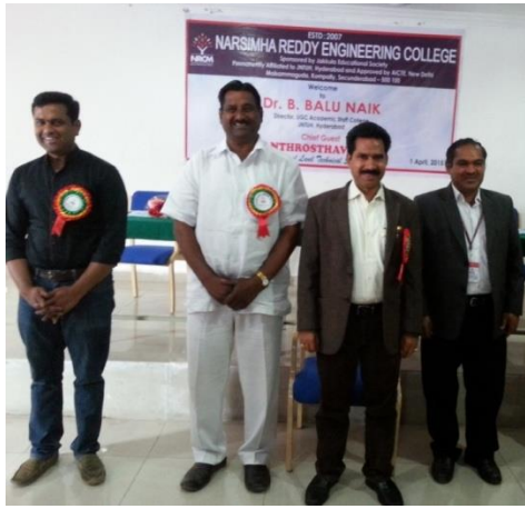
a. Technical Riddles in Yanthrotsav 2k15