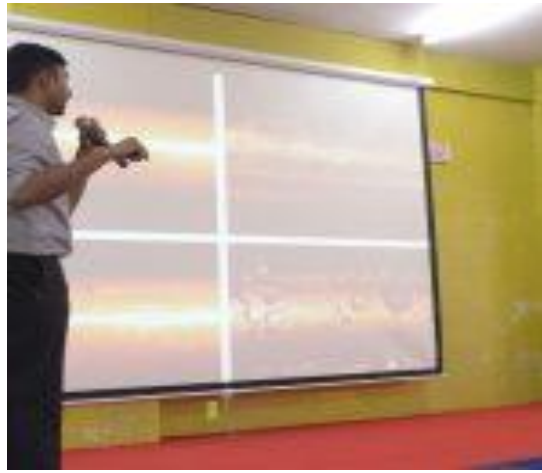
c. Paper presentations